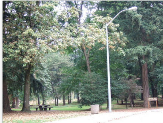
Grove of the States at Baldock Rest Area