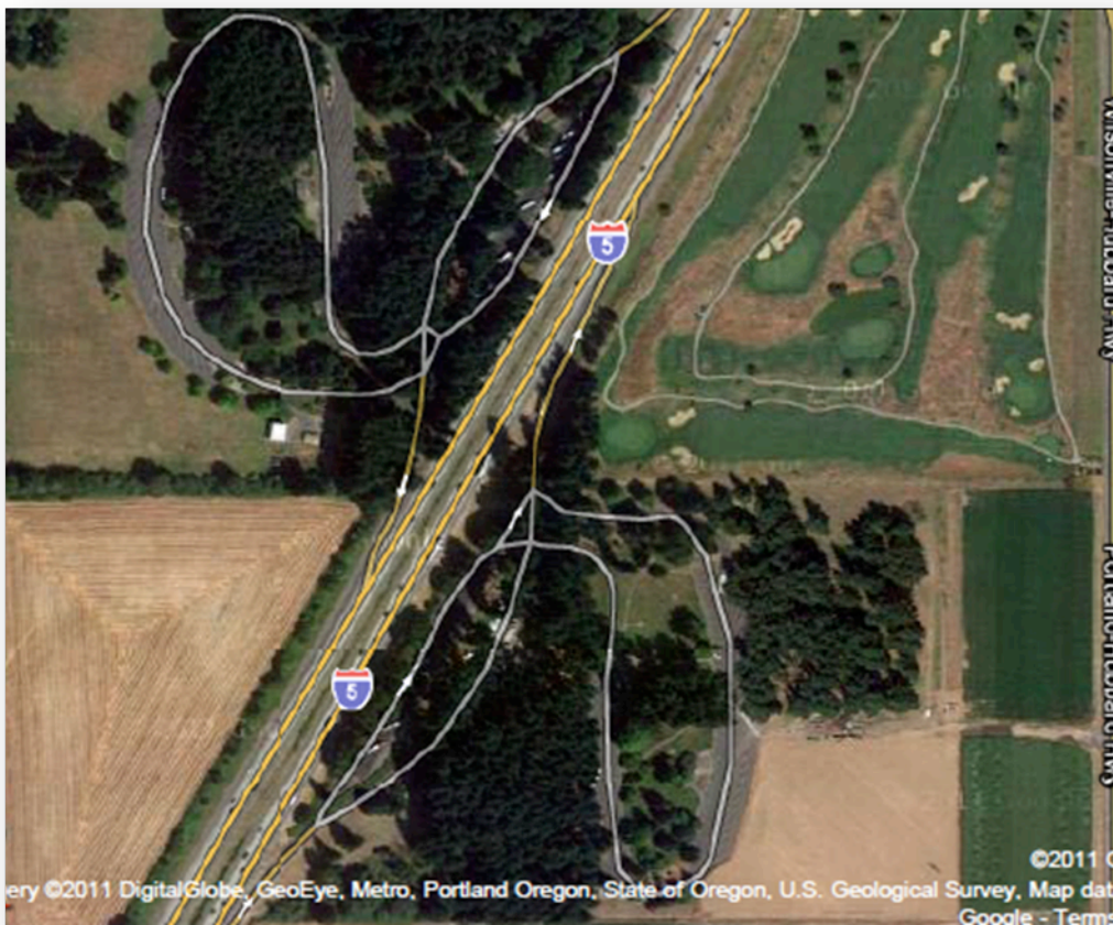
Image of Baldock Rest Area on I-5, Near Wilsonville

The 86-acre Baldock Rest Area, depicted above, consists of two sections of approximately the same size (northbound is 42.54 acres and southbound is 43.43 acres) that fall along either side of I-5 near Wilsonville, OR. Constructed in 1966 as part of the Oregon Interstate Highway System, the rest area was